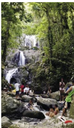
Above: A short hike near Roxborough brings you to Argyll Waterfall, which features three separate pools.

GET THERE > For more information on Tobago, turn to In Depth , page 91, section 2.