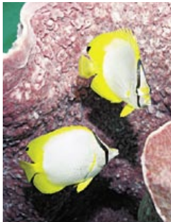
Top: Tobago is one of the best places in the Caribbean to spot golden hamlets (top), where you'll also find rock beauties (middle) and spotfin butterflyfish (bottom).